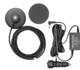
Soft Install Kit 318406*